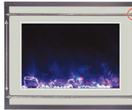
ZECL-39-4134 Arrowhead Overlay - Dark Pewter with Fire & Ice Model