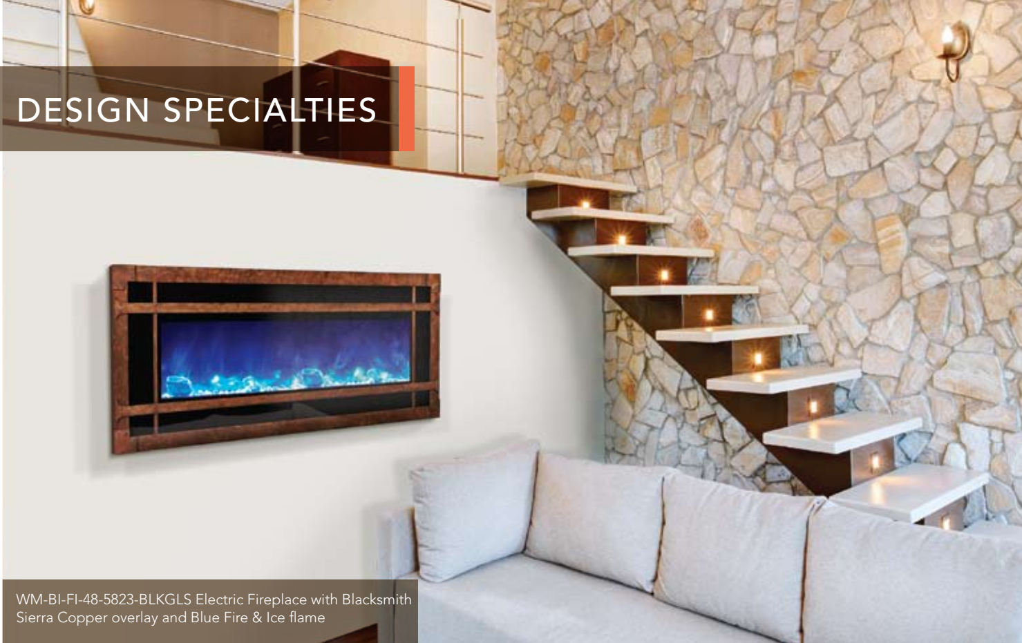
WM-BI-FI-48-5823-BLKGLS Electric Fireplace with Blacksmith Sierra Copper overlay and Blue Fire & Ice flame