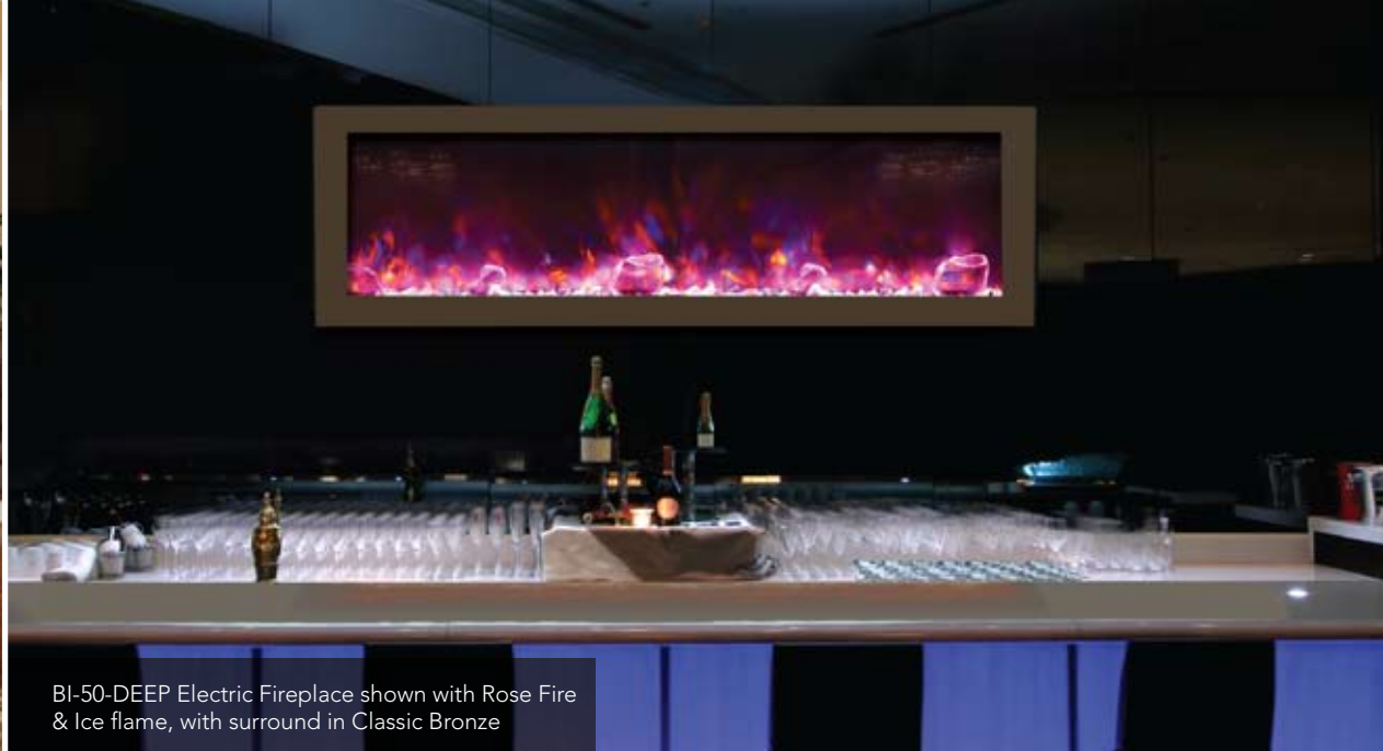
BI-50-DEEP Electric Fireplace shown with Rose Fire & Ice flame, with surround in Classic Bronze