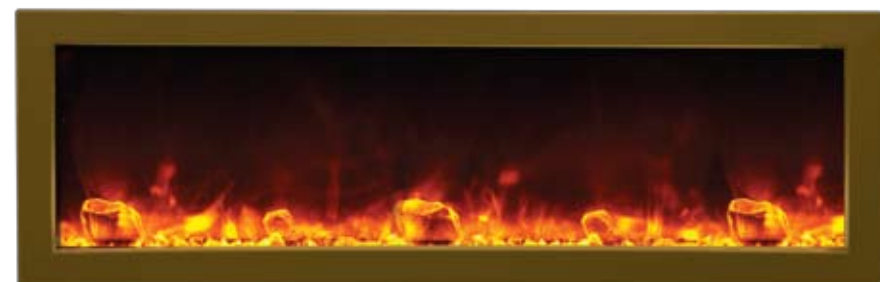
50-DEEP & 72-DEEP Overlay - Aztec Gold with Fire & Ice Model