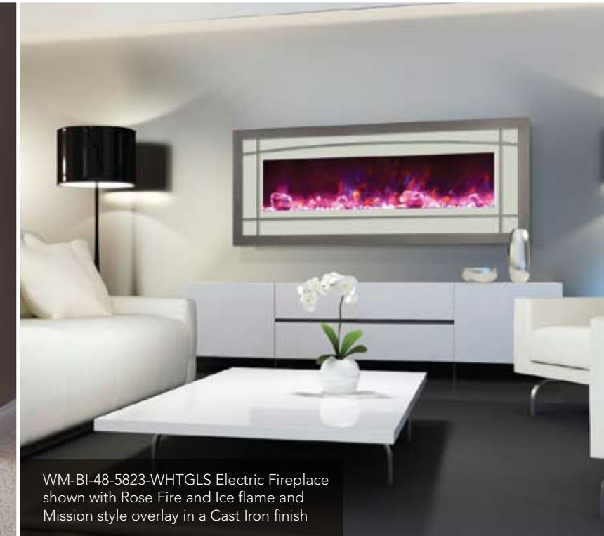
WM-BI-48-5823-WHTGLS Electric Fireplace shown with Rose Fire and Ice flame and Mission style overlay in a Cast Iron finish