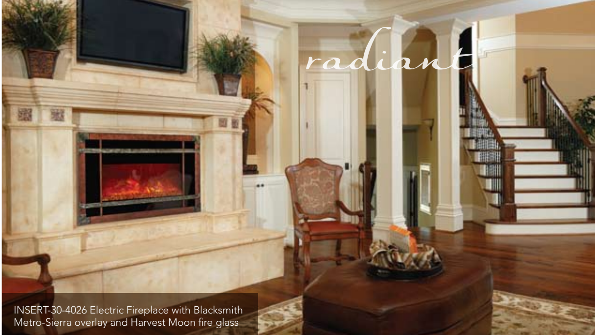
INSERT-30-4026 Electric Fireplace with Blacksmith Metro-Sierra overlay and Harvest Moon fire glass