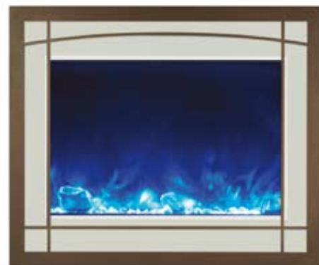
ZECL-39-4134 Mission Overlay - Classic Bronze with Fire & Ice Model