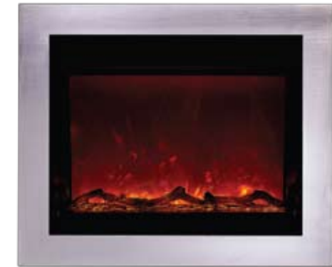
ZECL-39-4134 Laurel Overlay - Satin Nickel

With many styles to choose from and 20 standard power coated finishes, as well as 13 Artisan finishes, the design possibilities are endless. This allows customers to be a part of the design process creating a unique steel overlay perfectly suited for any living space.