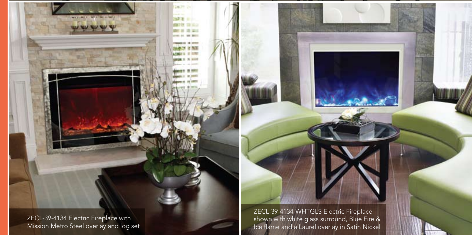
ZECL-39-4134 Electric Fireplace with Mission Metro Steel overlay and log set