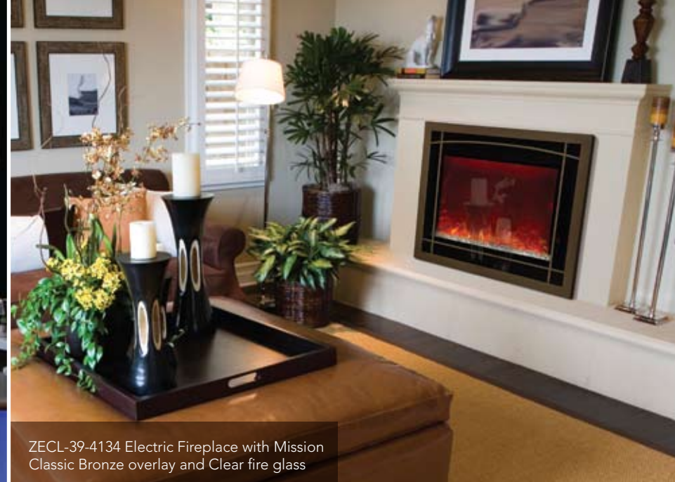
ZECL-39-4134 Electric Fireplace with Mission Classic Bronze overlay and Clear fire glass