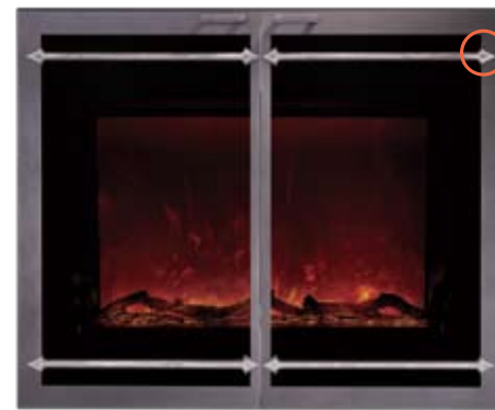
ZECL-39-4134 Arrowhead Door - Vintage Iron with screen