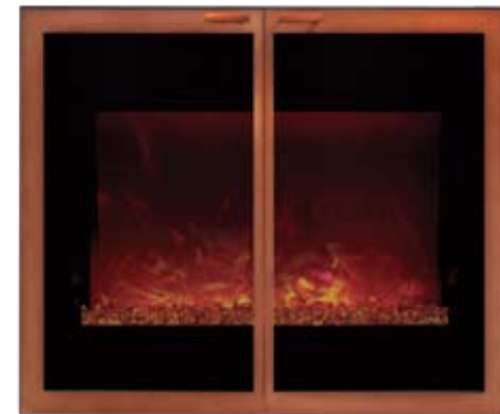
ZECL-39-4134 Arbor Door - Copper Fire with screen