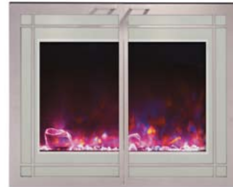
ZECL-39-4134 Mason Door Graphite with Fire & Ice Model, with screen