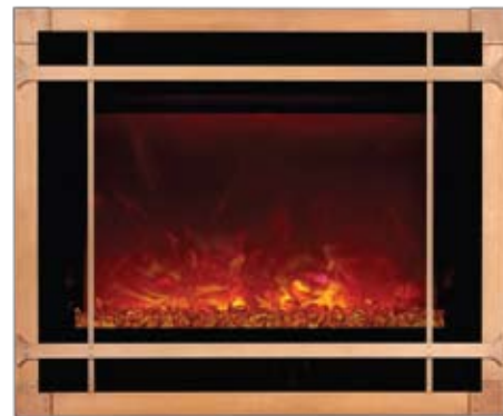
ZECL-39-4134 Blacksmith Overlay - Rustic Copper