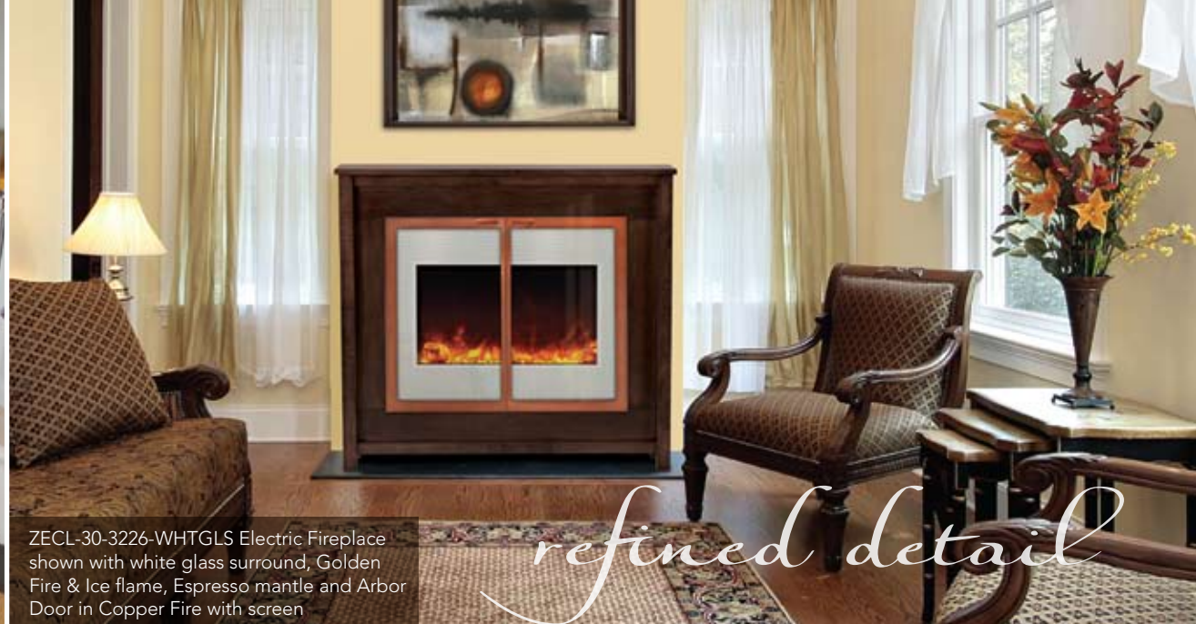
ZECL-30-3226-WHTGLS Electric Fireplace shown with white glass surround, Golden Fire & Ice flame, Espresso mantle and Arbor Door in Copper Fire with screen