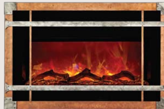
Shown on the INS-30-4026-TWO-TONE