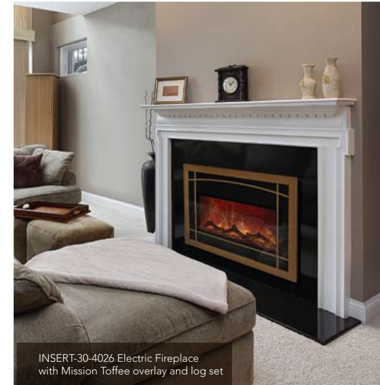
INSERT-30-4026 Electric Fireplace with Mission Toffee overlay and log set

With many styles to choose from and 20 standard power coated finishes, as well as 13 Artisan finishes, the design possibilities are endless. This allows customers to be a part of the design process creating a unique steel overlay perfectly suited for any living space.