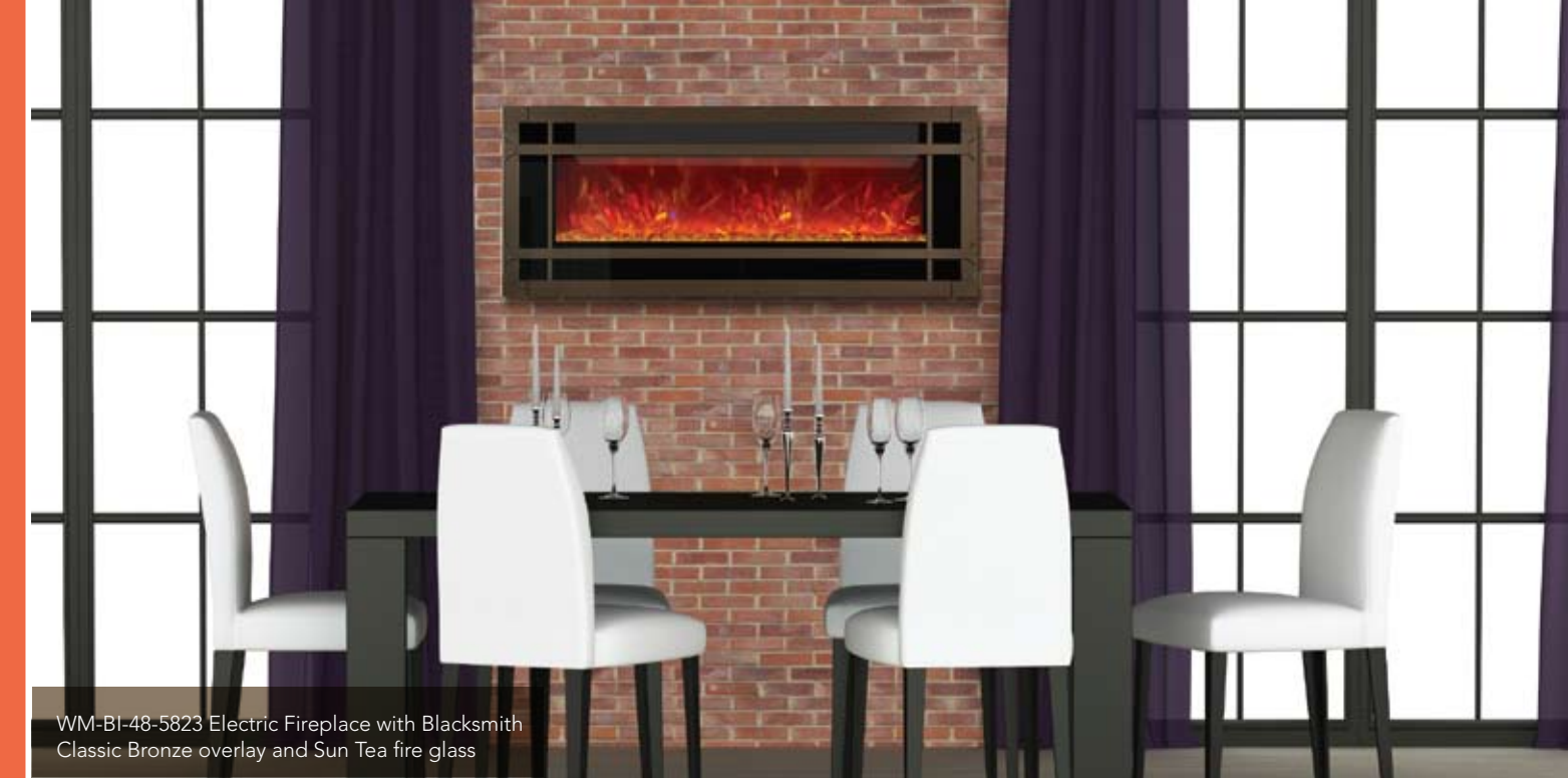
WM-BI-48-5823 Electric Fireplace with Blacksmith Classic Bronze overlay and Sun Tea fire glass

Phone: 888.406.8764 Fax: 877.498.4206 Web site: www.amantii.com