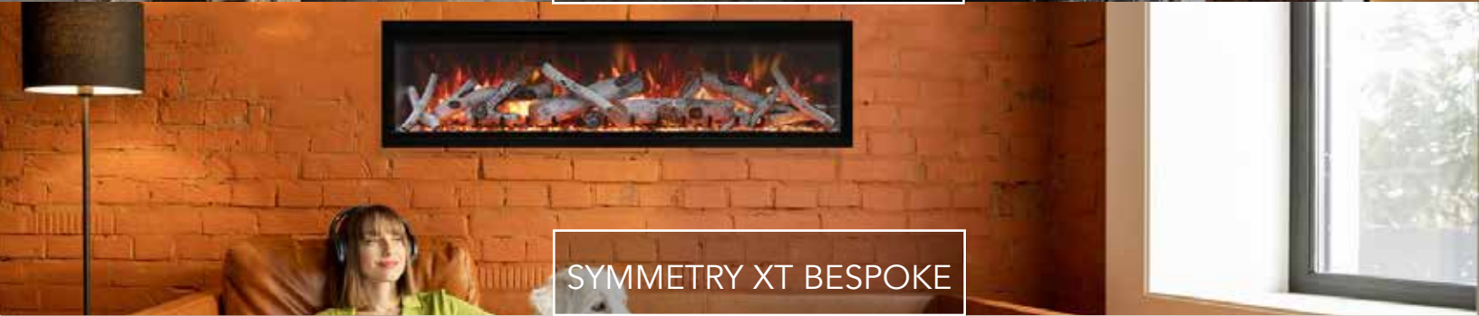
SYMMETRY XT BESPOKE