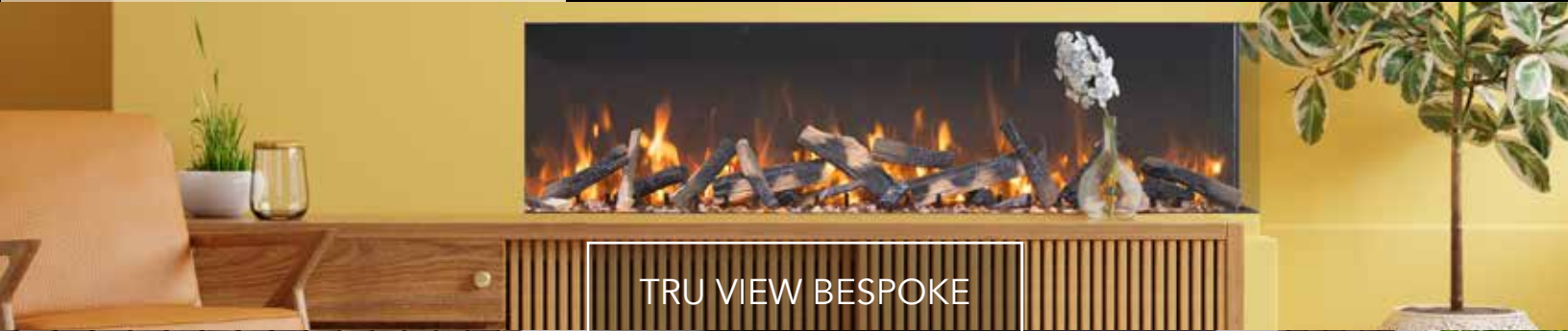
TRU VIEW BESPOKE