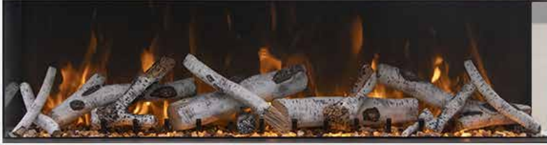
TRU VIEW XL