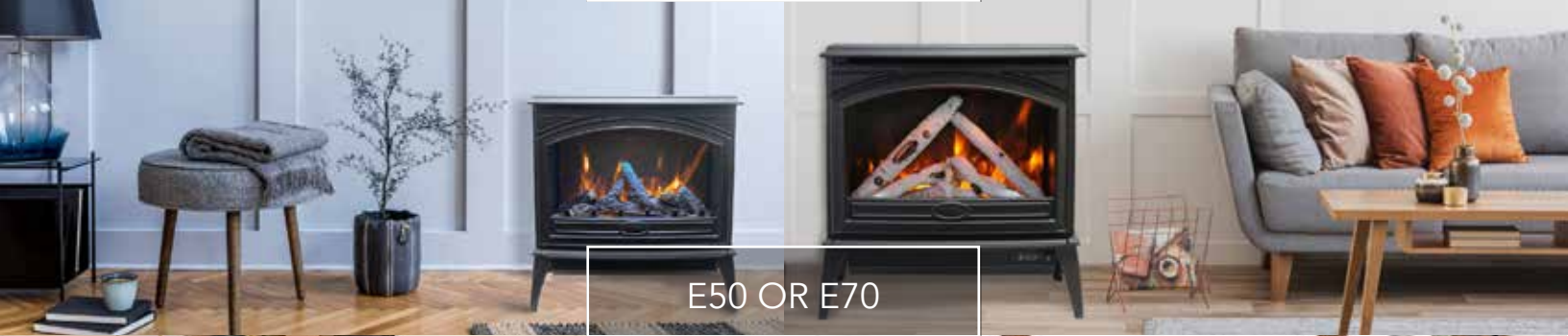
E50 OR E70