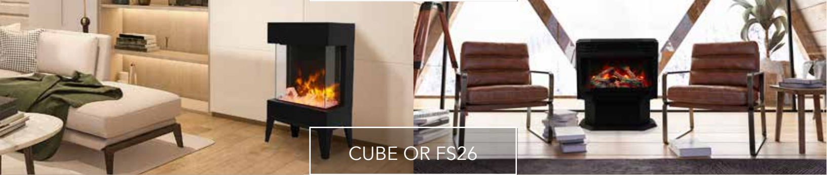
CUBE OR FS26

$2,995.00 FOR 3 UNITS Shipping & Taxes Additional