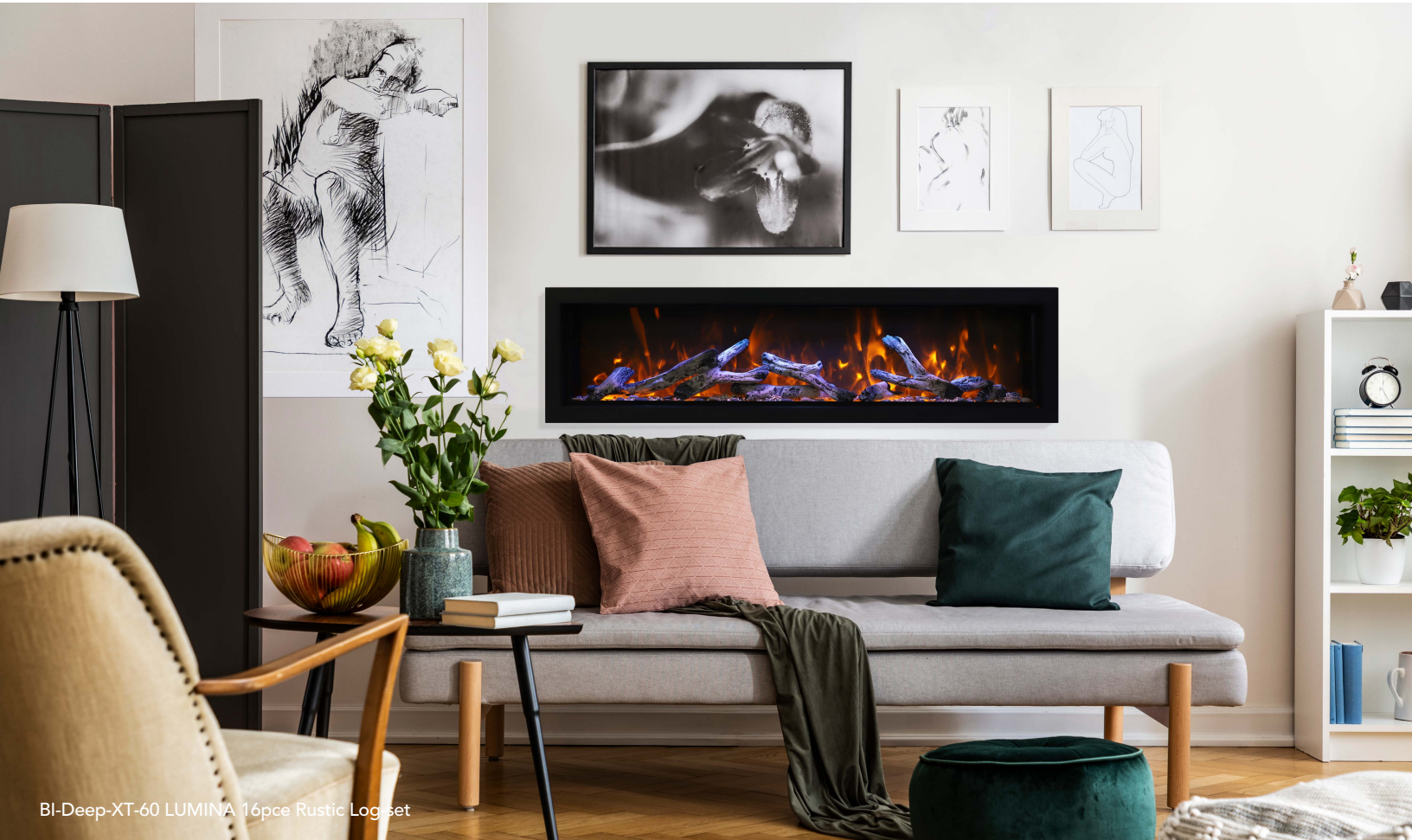
BI-Deep-XT-60 LUMINA 16pce Rustic Log set

The BI Deep XT Electric Fireplace takes design and ambiance to the next level with an even greater depth and taller glass height, perfectly suited for showcasing larger log sets. Combining innovative technology, cozy ambiance, and sleek, trimless aesthetics, it's ideal for seamless built-in installations. Customize your space with its deep tray and versatile options while enjoying the enchanting glow of vibrant flames in three captivating colors.