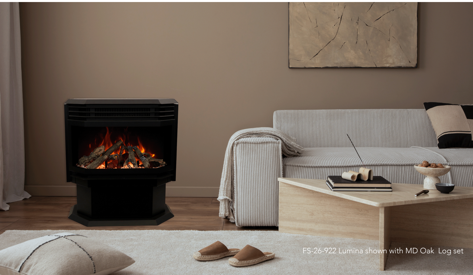
FS-26-922 Lumina shown with MD Oak Log set

A distinctly European styled free standing electric fireplace from Sierra Flame by Amantii. Featuring a beveled glass viewing area that gives an almost 'see-thru' effect on three sides. With no installation boundaries, no need for mounting brackets or building into a wall, this free stand model goes in any room you like. Virtually no assembly required - just simply plug in and enjoy!